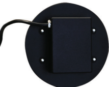
HTC-11 Back Plate